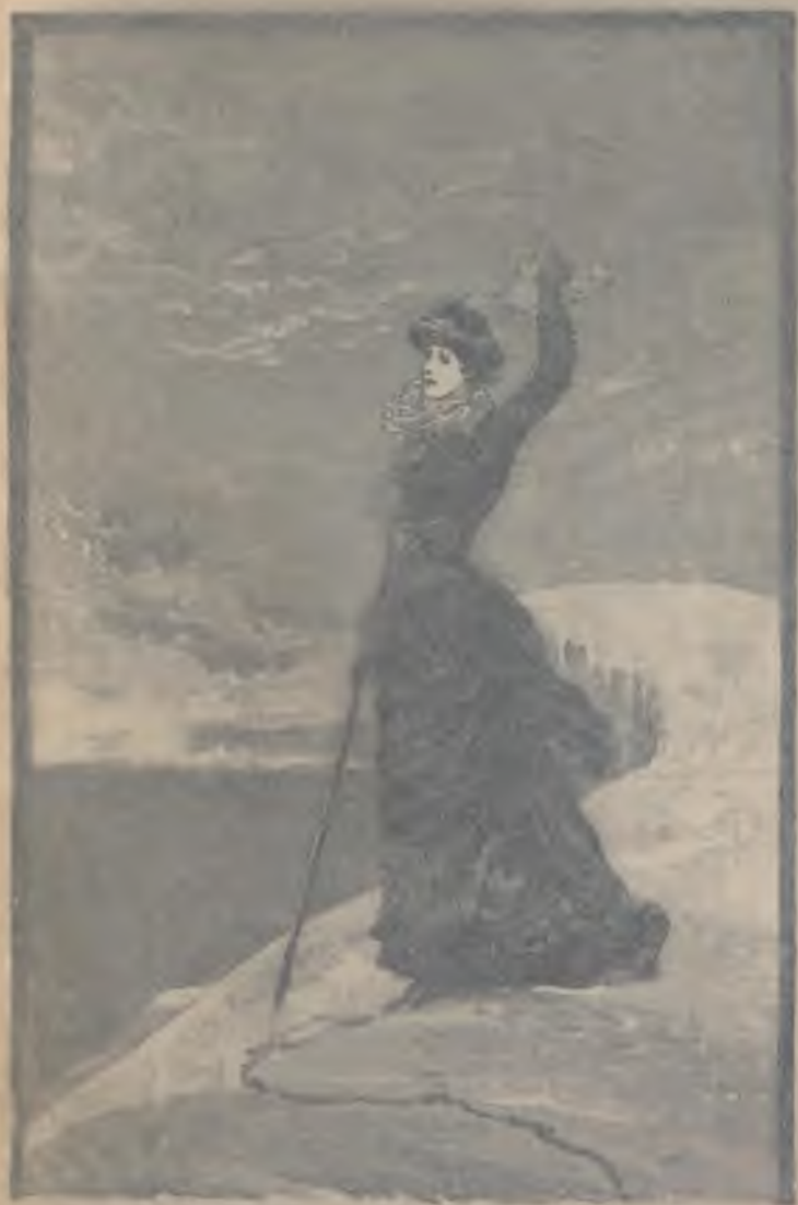
A VISION ON A SUMMIT